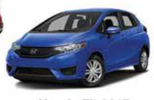
Honda Fit 2017

NEW & USED CAR SALES • CAR PARTS • CAR SERVICE • BODY SHOP