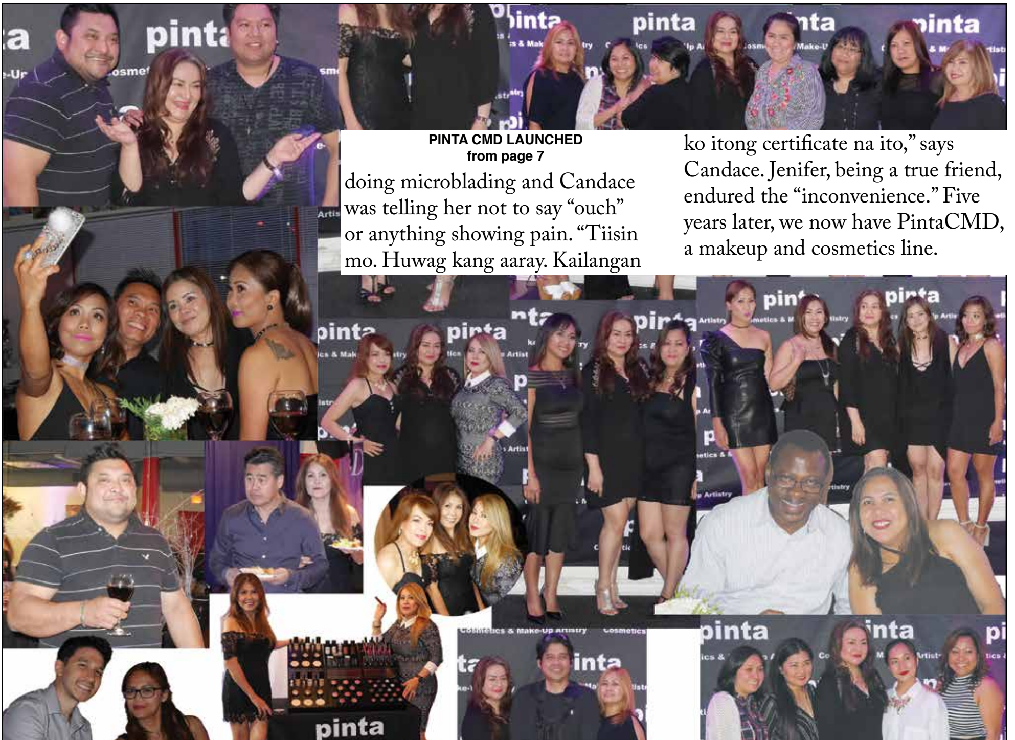
PINTA CMD LAUNCHED from page 7

doing microblading and Candace was telling her not to say “ouch” or anything showing pain. “Tiisin mo. Huwag kang aaray. Kailangan