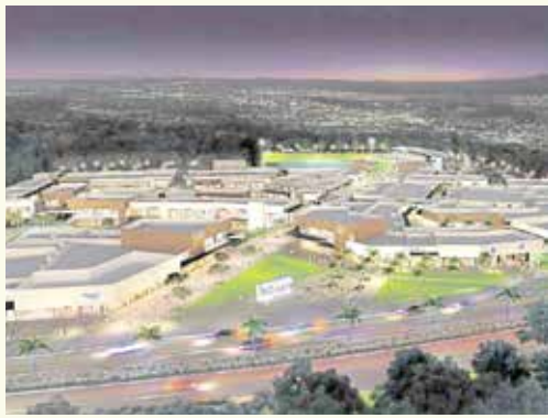
Artist's perspective of The Outlets at Lipa located in Batangas.

LIPA - In the time of the internet, social media, and digital advertising, Filipinos are better exposed to information on the latest fashion trends and the biggest brands worldwide.