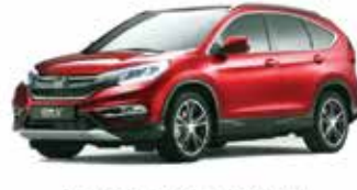
Honda CR-V 2017