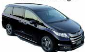
Honda Odyssey 2017