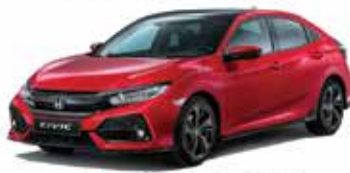
Honda Civic 2017