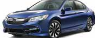
Honda Accord 2017