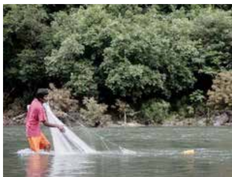
A member of Dumagat community catches fish in Agos River.

"PRC state-run or state-influenced media outlets have accounts on most social media channels to amplify their digital content," the AidData study said.