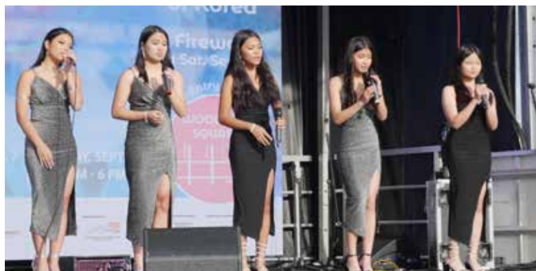
RIGHT, JDL Singers

JDL School for Performing Arts. They impressed the crowd with their performances.