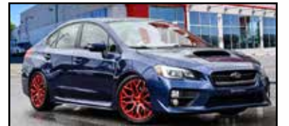
**2016 Subaru WRX Base FROM $ 17,690