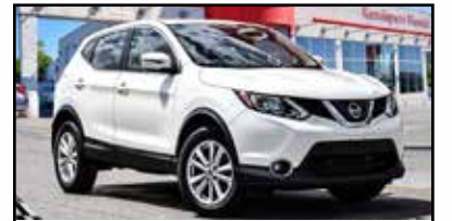
**2019 Nissan Qashqai SV FROM $ 15,990