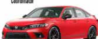
Honda Civic 2024