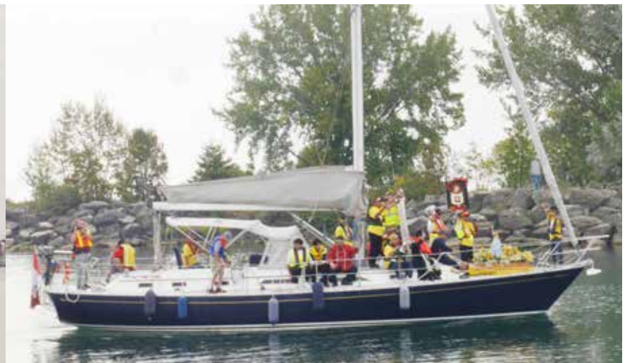
Yachts that participated in the Bicol Canada fluvial parade make their way back.