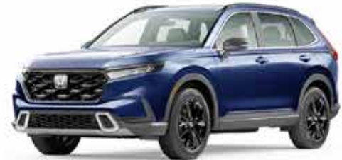
Honda CR-V 2024