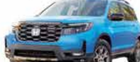
Honda Passport 2024