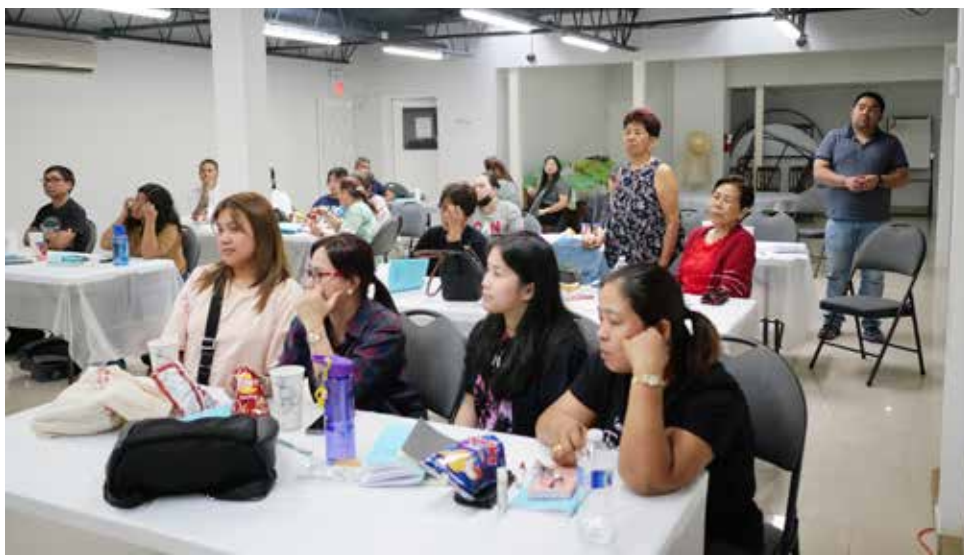
International students attend a food handling certificate course held at The Filipino Centre, Toronto.

government explained the rationale for changing the program as follows: