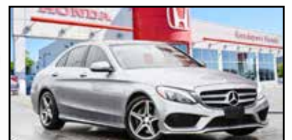
**2016 Mercedes-Benz C-Class C 300 4MATIC FROM $ 17,990

Call Harold for Appointment 416-578-7351