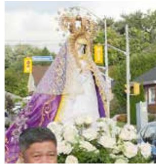
Mother Mary in different representations: Bicol Canada Association's Our Lady of Penafrancia, Casaroca's Our Lady of Nativity, and Dolorosa's Our Lady of Sorrows,

Philippines were under Spanish rule from 1565 to 1868.