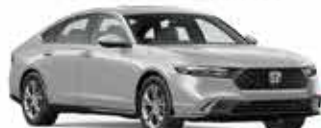
Honda Accord 2024