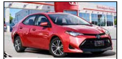
**2018 Toyota Corolla LE FROM $ 17,990