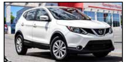
**2019 Nissan Qashqai SV FROM $ 15,990