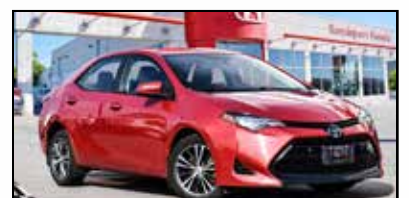
**2018 Toyota Corolla LE FROM $ 17,990