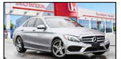
**2016 Mercedes-Benz C-Class C 300 4MATIC FROM $ 17,990

Call Harold for Appointment 416-578-7351