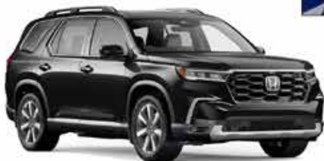
Honda Pilot 2024