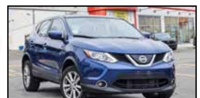
**2018 Nissan Qashqai SV FROM $19,687