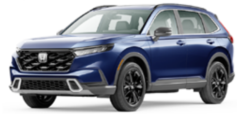
Honda CR-V 2024