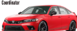
Honda Civic 2024