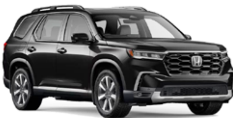
Honda Pilot 2024