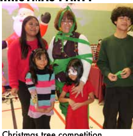
Christmas tree competition