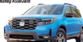
Honda Passport 2024