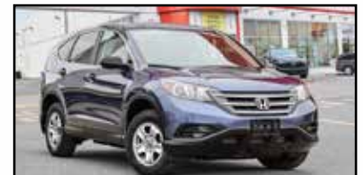
**2014 Honda CR-V LX FROM $19,005