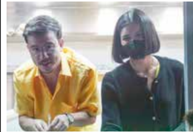
Quezon City's first district Congressman Juan Carlos "Arjo" Maine Mendoza

Atayde said the presence of Artificial Intelligence (AI) should be used to empower the productivity of Filipino workers all over the country – and not to replace them.