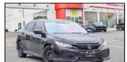
**2018 Honda Civic w/Honda Sensing FROM $ 19,084