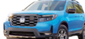
Honda Passport 2024