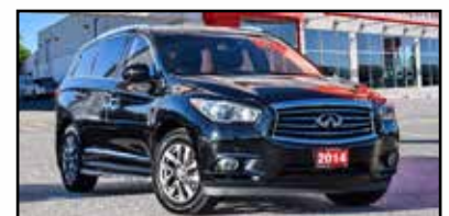
**2014 Infiniti QX60 Base FROM $ 18,886