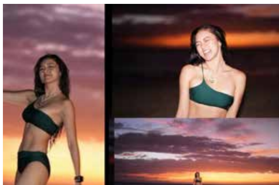
and everything in between," she further added. The actress' post earned the support of her fol-