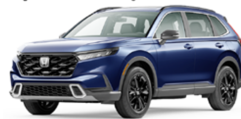
Honda CR-V 2024