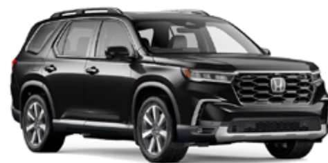
Honda Pilot 2024