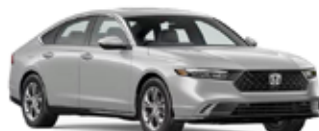
Honda Accord 2024