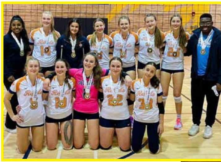
Rebels Smash takes home gold at the 17U Challenge Cup, Select B. Smash had an amazing third set gold medal match with a 16-14 comeback after being down 9-13 against Perkmen Gold!